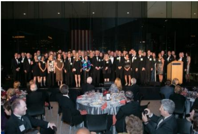
Class of 2015