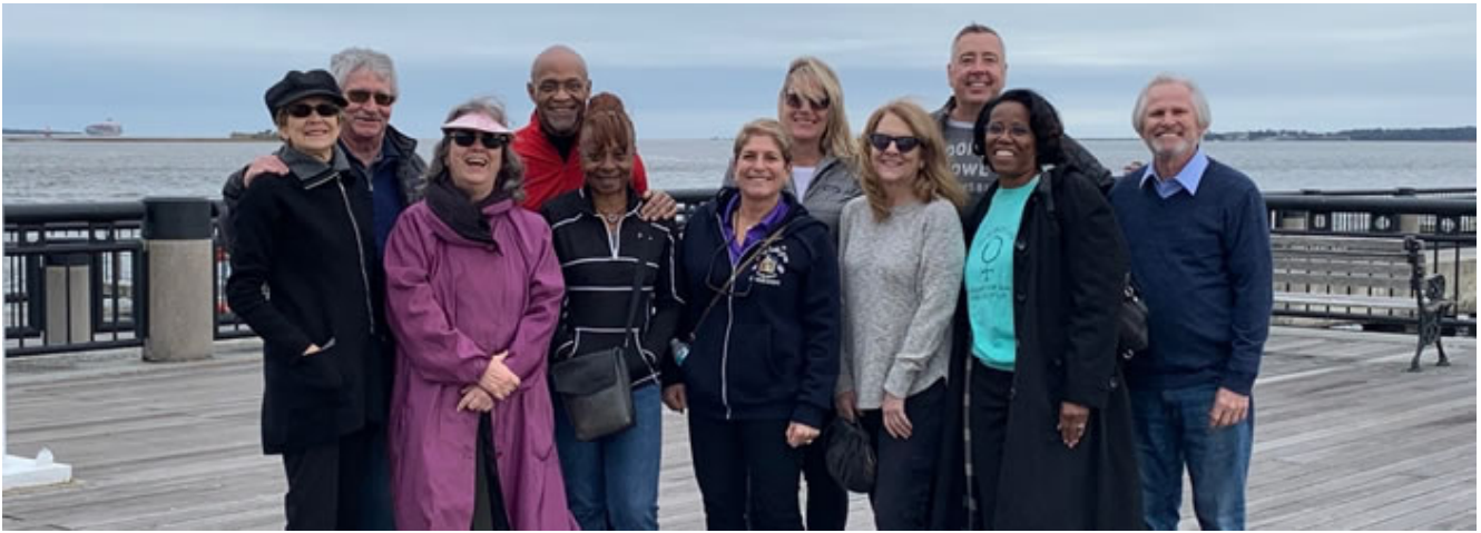
A walk on the Charleston waterfront!